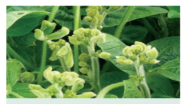
Terminal growth inhibited; new leaves puckered when growth resumes