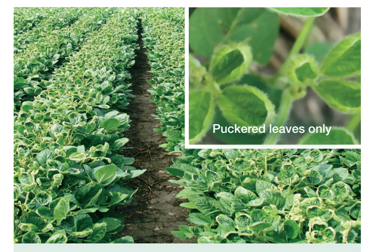
Image 1. Terminal growth continues with new puckered leaves visible